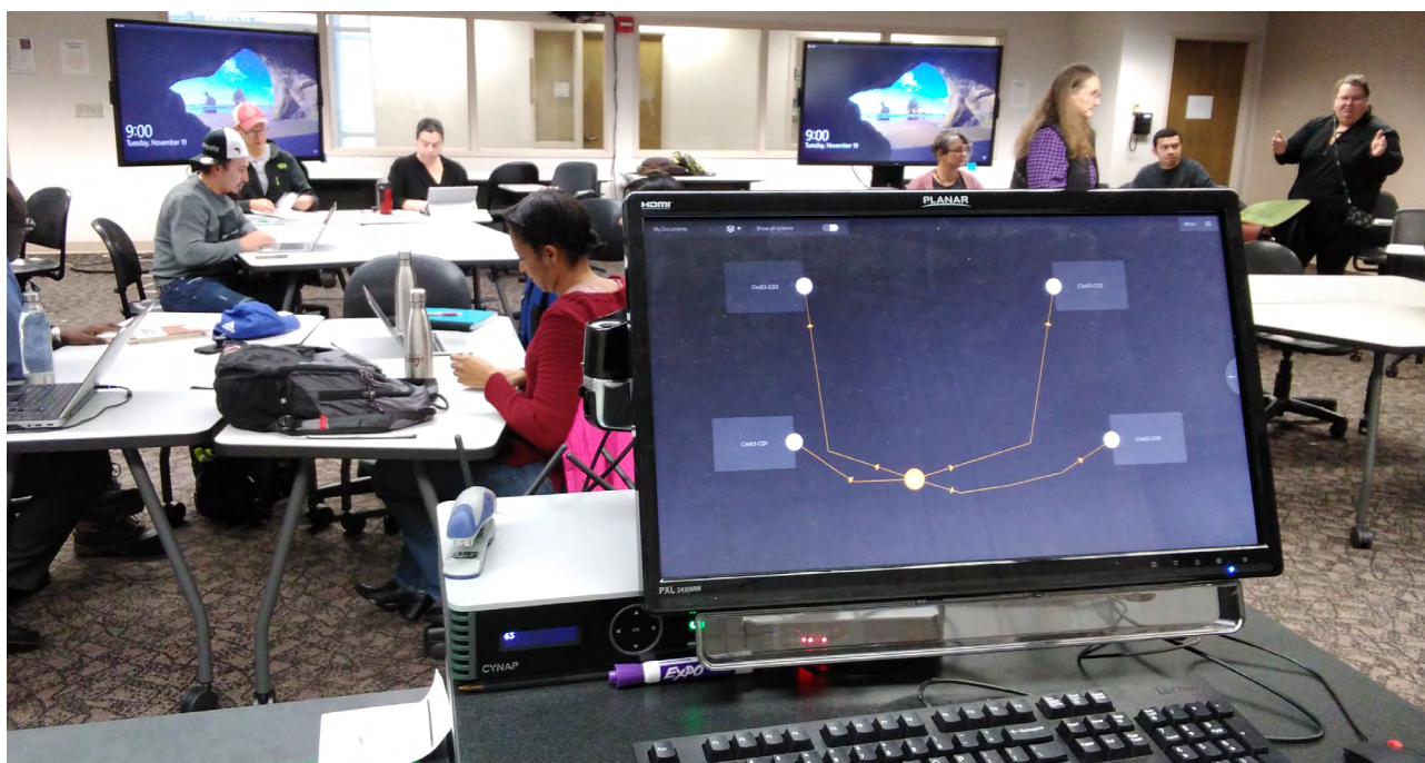
The vSolution MATRIX customized Room View makes it extremely easy to 'drag and drop' content between screens.

the MATRIX system also shine is when we have instructors who want to breakout into groups. We really like the Cynap product line, and have received very good support." WolfVision is extremely proud to play a key supporting role in student education at Washington State University, and it is exciting to see how they have successfully implemented this state-of-the-art AV over IP active learning classroom collaboration solution.