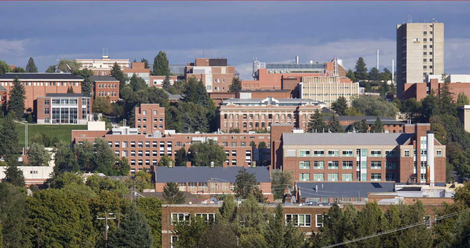
Washington State University, Pullman Campus, Washington, USA

F ounded in 1890, Washington State University (WSU) is a public research university in Washington, USA. With around 30,000 students across its four campuses, it is the second largest institution for higher education in the state of Washington. At the College of Education on the Pullman Campus, WSU had a need for a flexi-