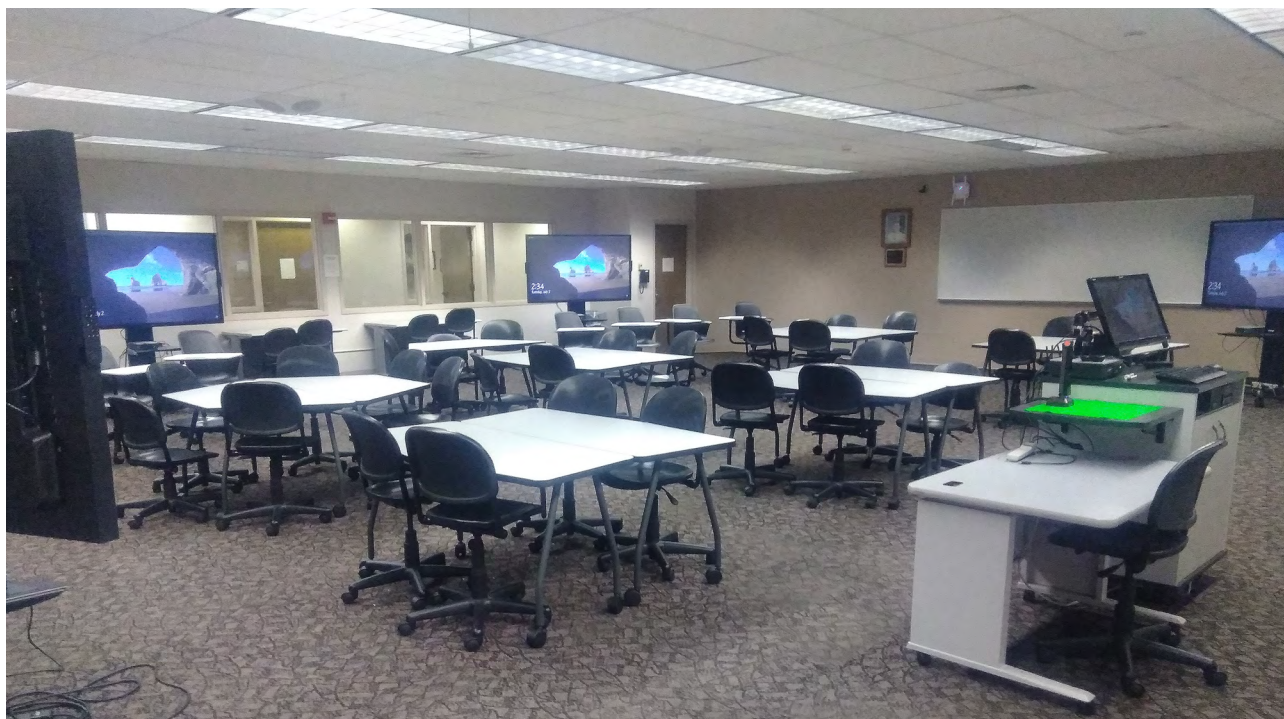
The new learning space can either be used as an active learning classroom or as an independent study area.