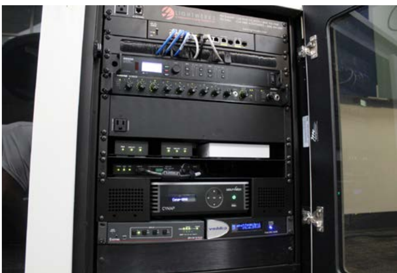
Rack-mount installation of WolfVision Cynap at SRHD.

connect to Zoom. I can almost guarantee nobody in the meeting will see a better image than ours." The Cynap was chosen not only for its excellent connectivity options, but also for its 'all-in-one' versatility, outstanding quality, and ease of use. The customizable user interface makes setup and use simple enough for anyone