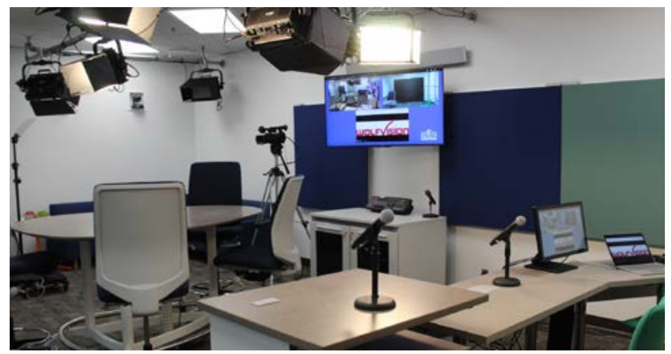
Dual wireless Shure SM58 microphones are used for audio. A Nureva HDL300 audio conferencing system is used to pick up audio from every part of the room in situations where groups of speakers are using the room.

training session, an interview or group discussion, high quality content can now be quickly and easily produced whenever it's required. WolfVision is extremely proud to play its part in helping to improve communications at SRHD, and looks forward to providing support and advice to this important regional institution and its partner agencies for many years to come.